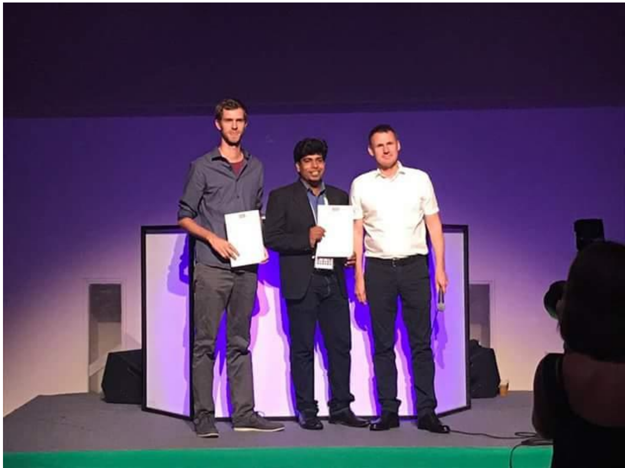
Fig. 1: Photo during Award Ceremony

Affiliation: Department of Applied Geophysics, IIT (ISM) Dhanbad, Jharkhand, India